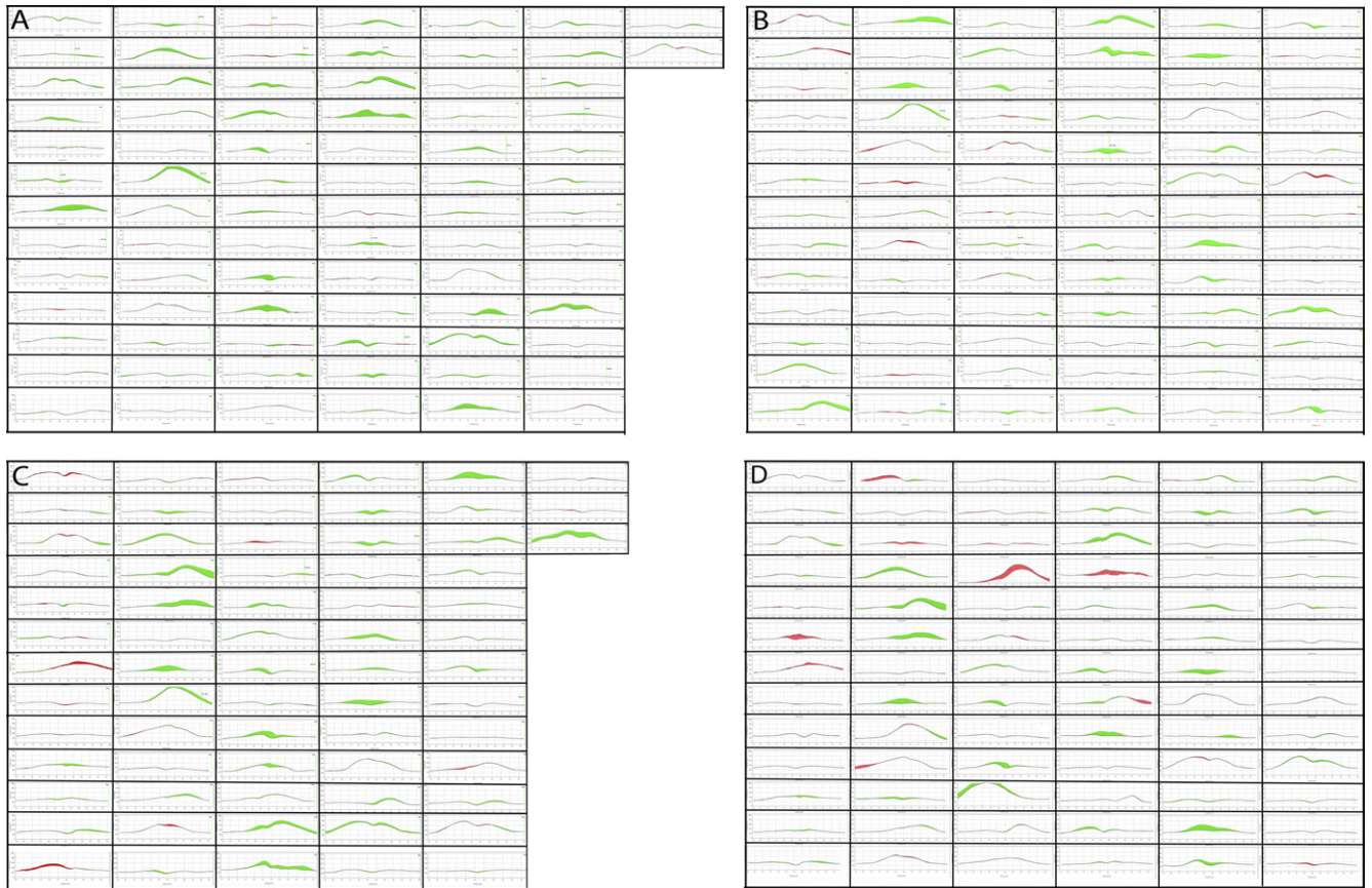
Figure 2. Change maps for all patients after 1 week (A), 1 month (B), 2 months (C), and 3 months (D). Green indicates decrease in retinal thickening, and red indicates an increase in retinal thickening.

pneumatic displacement of subretinal hemorrhage 2 years before study entry. At screening, his ETDRS VA was 36 letters (20/191), and 22 days after the third 2.0-mg intravitreal ranibizumab injection, a submacular hemorrhage developed with a decrease in vision to 27 letters (20/289). It is unknown whether the higher dosage of ranibizumab played